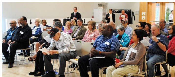
Attendees at the RECA Annual Meeting

RECA's annual meeting was held on May 3 in the new Student Center at St. Andrew's Episcopal School. Residents who attended the meeting were provided with a variety of appetizers and drinks, including wine!