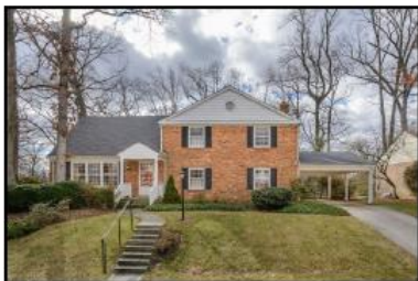
12014 Smoketree RD- SOLD