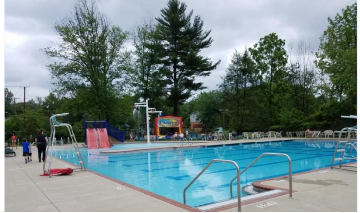
A pristine pool with the ever-popular moon bounce in the background.