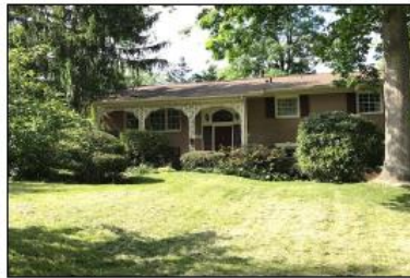
Coming Soon - 8309 Raymond