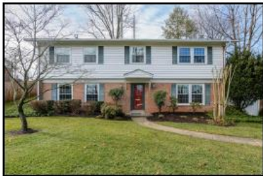
11626 Deborah Drive - SOLD