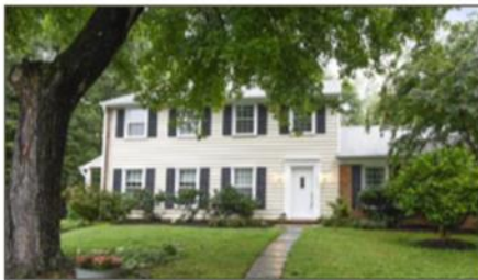
11907 Smoketree RD—SOLD

I Specialize in Selling Homes in the Churchill School District