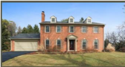
9001 Rouen Lane - SOLD