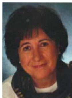
Fifa Northrop Realtor

Plenty of residents have not yet taken advantage of the service. Judging by the volume of threads, Nextdoor is proving to be a very valuable resource to those who have signed up for the service. I must once again emphasize that RECA has no commercial or other relationship or involvement with Nextdoor or in the administration or moderation of Nextdoor neighborhoods. It is simply a tool we are promoting to fill a need for which RECA has not been able to provide a solution. The more residents that sign up, the more valuable it becomes.