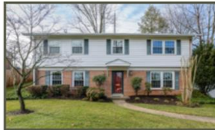
11626 Deborah Drive - SOLD