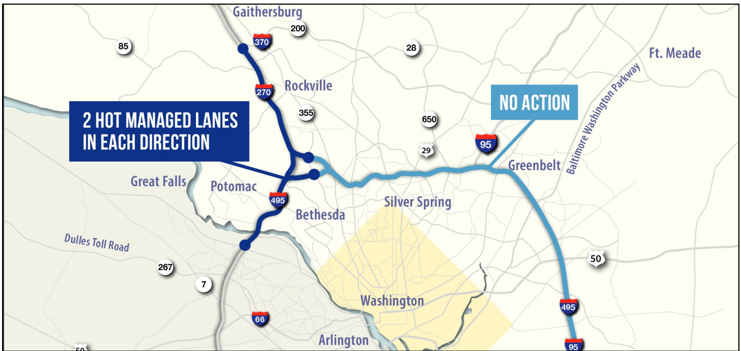
The future of DMV interstates with Alternative 9.

On May 12, 2021 the State Highway Administration presented a new Recommended Preferred Alternative (RPA) for the Managed Lanes Study to the agency partners named Alternative 9: Phase 1 South. This new RPA will address existing traffic and long-term traffic growth, enhance trip reliability, provide additional travel options and improve the movement of goods and services within Phase 1 South. The RPA will provide significant pedestrian and bicycle commitments to improve the connectivity of area sidewalks and trails, including the addition of a multi-use trail on the new American Legion Bridge across the Potomac River.