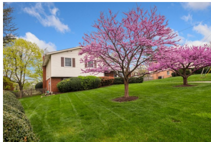
11615 Greenlane Drive - Sold

Our real estate market in zip code 20854 has been so very hot since January 2021 due to minimal inventory & very low interest rates. If you're thinking of selling your home, call me! I will give you an honest evaluation of your home and an update on our Potomac Market!