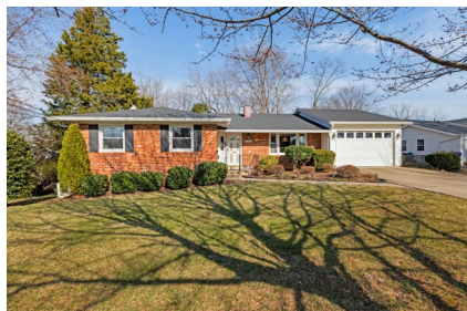
11819 Enid Drive — Sold

I Specialize in Selling Homes in the Churchill School Cluster