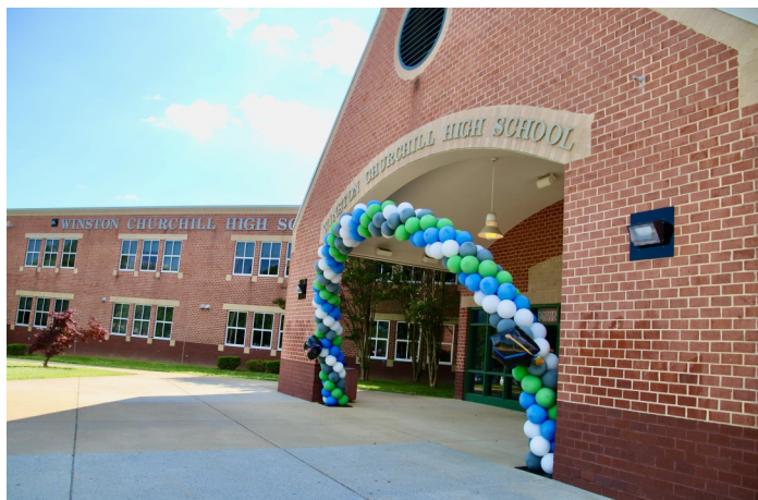
WCHS commemorates the Class of 2021 graduating class with a festive balloon arch.

To say 2020 was a long year is certainly an understatement, especially if you are a high school senior. Imagine the disappointment of doing all that hard work — taking entrance exams, applying for college and finally being accepted — only to be told to stay home. But as schools across the nation begin to reopen for in-classroom learning, we share your excitement for the amazing journey you will finally begin.