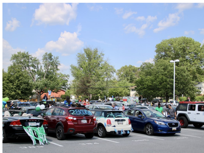
taken during the 2021 Senior Car Parade.