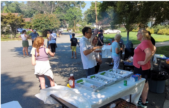
Neighbors catch up on another whirlwind of a year.

With the recent housing market boom, both streets saw the arrival of new residents. It was a pleasure to see several new faces at the event. The block party was a wonderful way for both young and old, recent and established neighbors to relax and refresh before the arrival of the colder months.