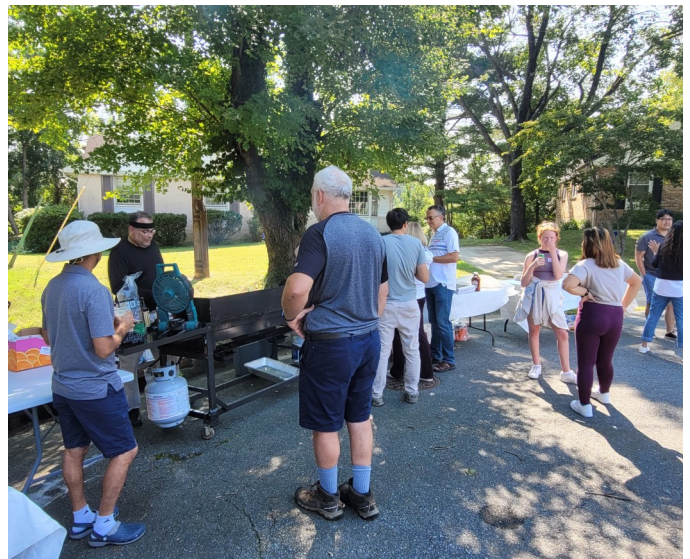
Lining up for some hot hamburgers fresh from the grill.