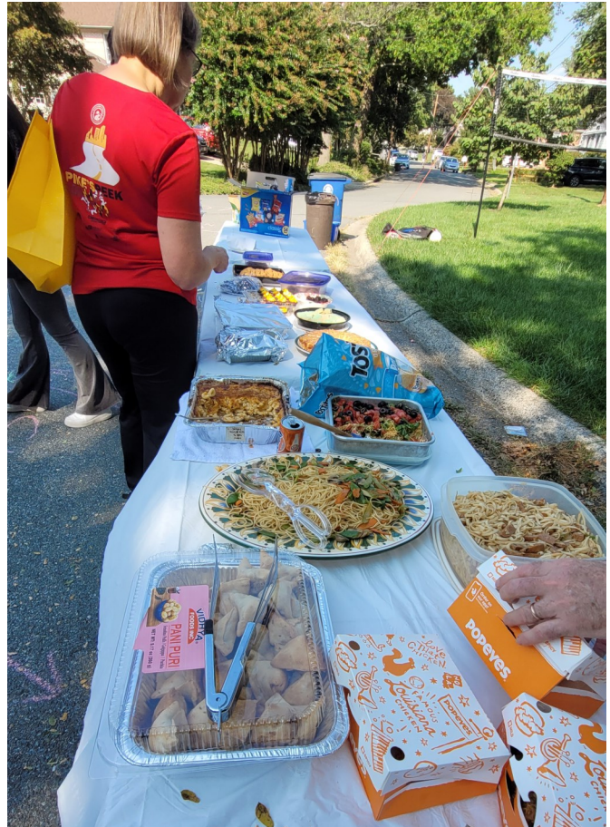
Showcasing our impressive spread of neighborly treats.